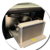
CoolBlu Refrigeration Module