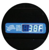
Front Visible Temp