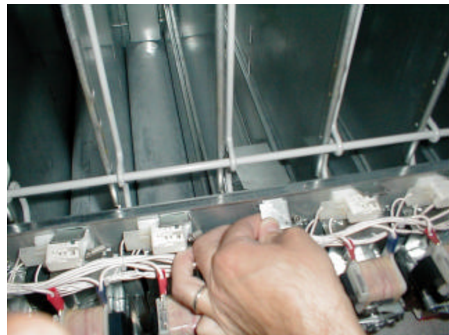
Figure 6 1 - 432,070,17x.x3 Narrow Column Sold-Out Paddle