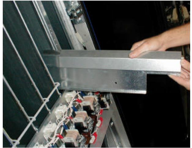
Figure 2 Can Shim Installation