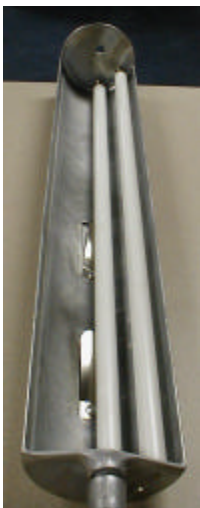
Figure 5 609,070,30x.x3 Rod & Spring Assembly 801,903,24x.x1 White Tube