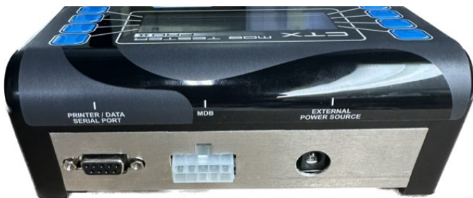
Optional printer and Data port

Input connector for the 24vdc power supply E04350.